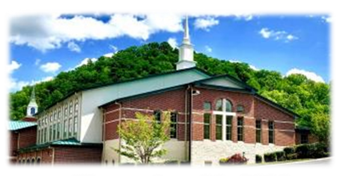
November 22, 2020