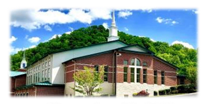
November 15, 2020